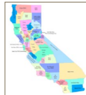
Weed Management Areas

This map and document with regional invasive plant EDRR targets was updated in October 2021, in collaboration with the California Department of Food and Agriculture, County Agricultural Commissioners, and Weed Management Areas. We encourage you to contribute observations of regional EDRR weed species!