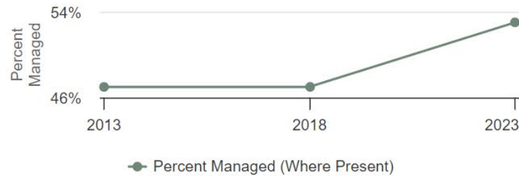
Management Percent (Where Present)