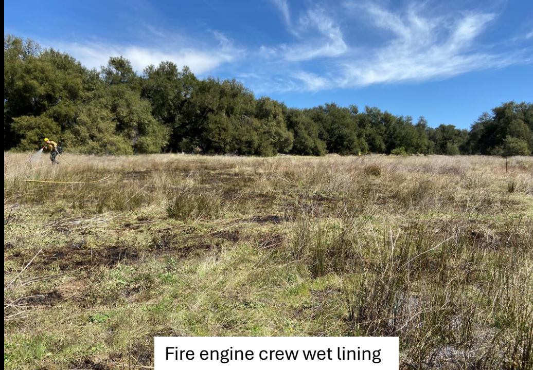
Fire engine crew wet lining