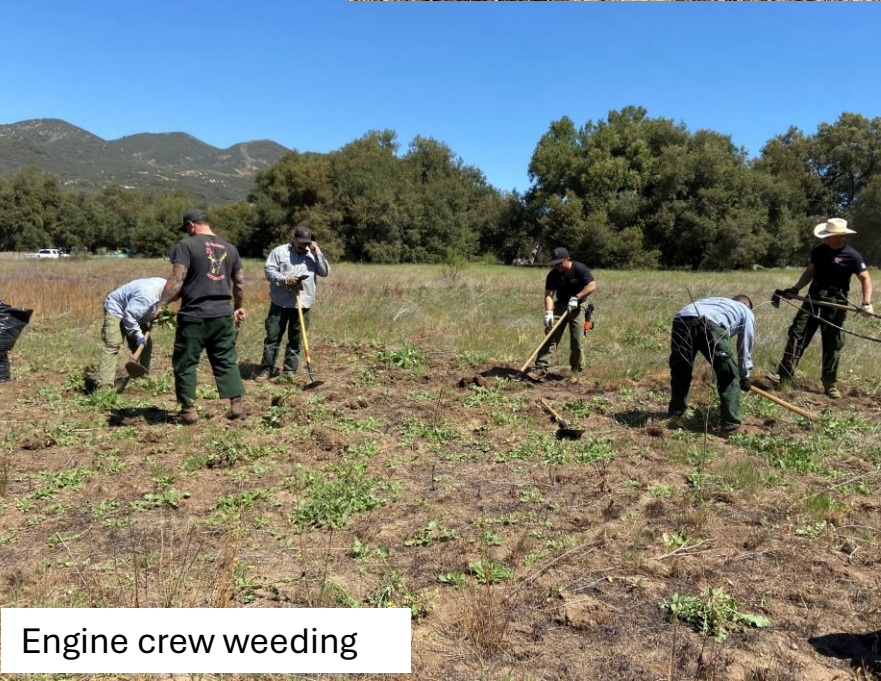
Engine crew weeding