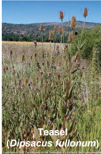
Teasel (Dipsacus fullonum)