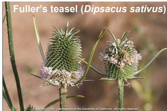
Fuller's teasel ( Dipsacus sativus )