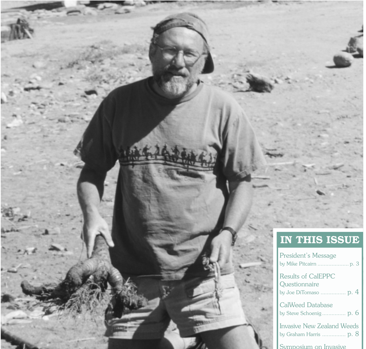
Volunteer displays rooted Arundo donax washed onshore during El Niño storms. See page 5 for article.