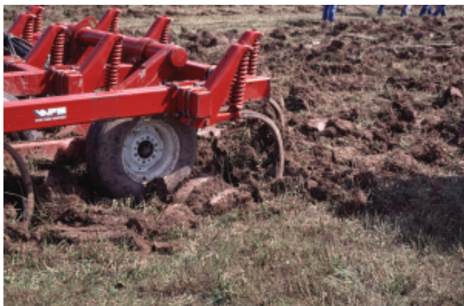
Tillage. Harrowing, a kind of tillage, damages the roots and separates shoots from roots in young plants.