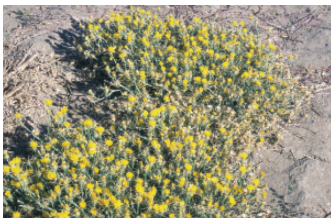
Pincushions. If mowed too early, yellow starthistle may recover and form a “pincushion” of low-growing flowerheads.