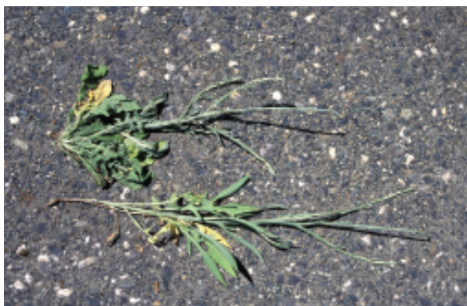
Two branching patterns. Yellow starthistle rosettes in full sunlight grow compact and flattened (top). In grasslands where they receive less light, rosettes develop a more erect growth form (bottom). The erect form is more susceptible to mowing.