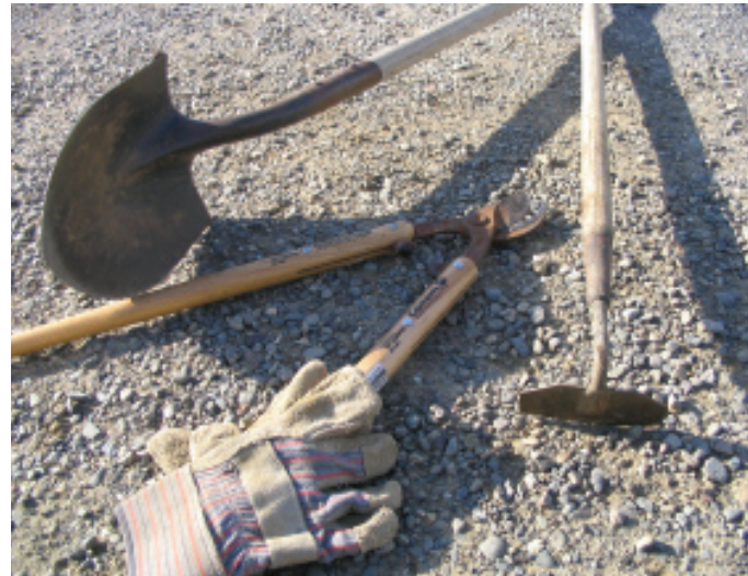
Hand tools. Shovels, lopper, and hoes are effective for small, sparsely-spaced populations.

Manual removal of yellow starthistle is most effective for controlling small patches or in maintenance programs where plants are sparsely located in the grassland system. This usually occurs with a new infestation or in the third year or later in a long-term management program. It can also be an important tool in steep or uneven terrain where other mechanical tools (e.g., mowing and tillage) are impossible to use (Woo et al. 1999). To ensure that plants do not recover it is important to detach all above ground stem material. Leaving even two inches of rooted stem can result in recovery if leaves and buds are still attached to the base of the plant (Benefield et al. 1999). The best timing for manual removal is after plants have bolted but before they produce viable seed (early flowering). At this time, plants are easy to recognize and some or most of the lower leaves have senesced. Hand removal is particularly easy in areas with competing vegetation. Under this condition, starthistle will develop a more erect, slender stem with few basal leaves. These plants are relatively brittle and easy to remove. In addition, they rarely have leaves attached