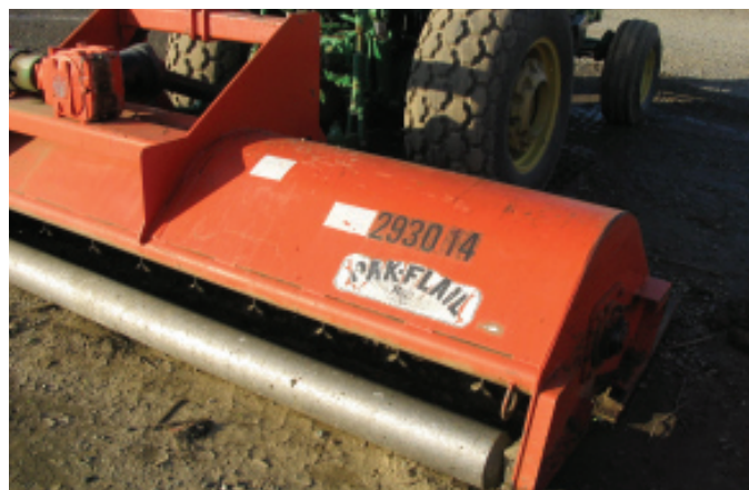
Flail mower.