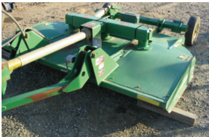
Deck mower.

Tillage must be applied when the surface soil is dry, or fragmented plant segments can re-grow and possibly magnify the problem. Despite its effectiveness in controlling annual weeds, it can damage important desirable species, expose the soil for rapid reinfestation if subsequent rainfall occurs (DiTomaso and Gerlach 2000a), and prolong the longevity of yellow starthistle propagules by burying seeds deep in the soil profile. In addition, it can alter soil structure (e.g., by compaction), increase erosion, and cause the loss of soil moisture by exposing subsoil. Heavy equipment also produces fuel exhausts and raises dust, including fine particles \leq 10 microns in diameter (PM10) (DiTomaso 1997).